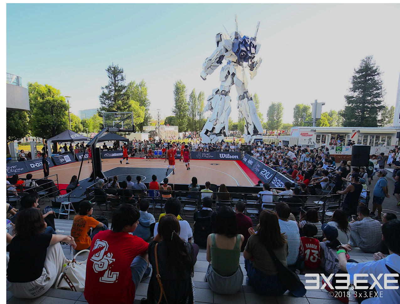
Odaiba, Tokyo, Japan