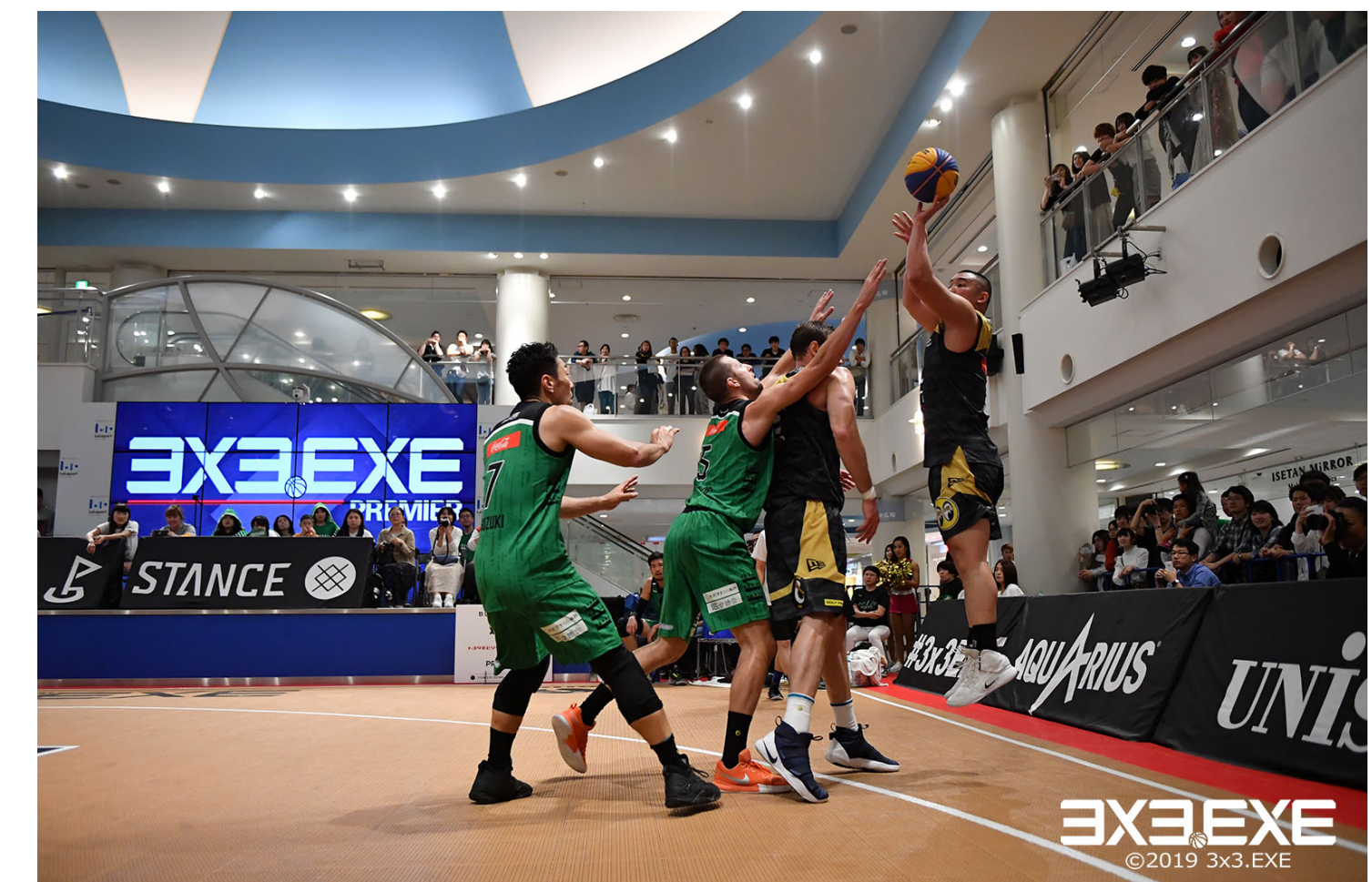
LaLaPort Tokyo Bay, Tokyo, Japan