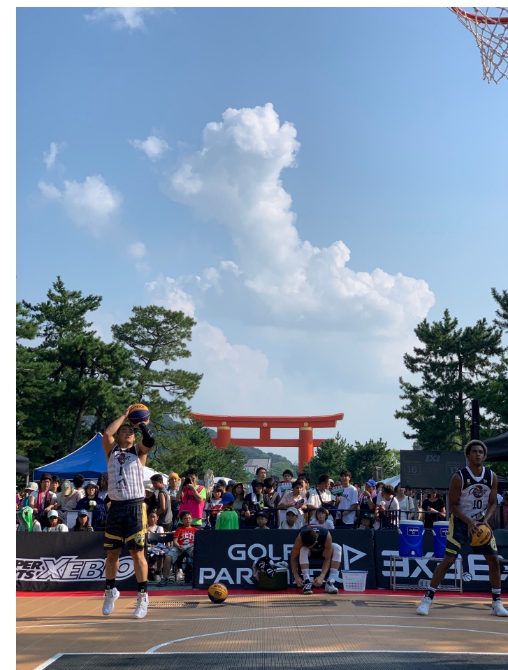
Heian Shrine, Kyoto, Japan