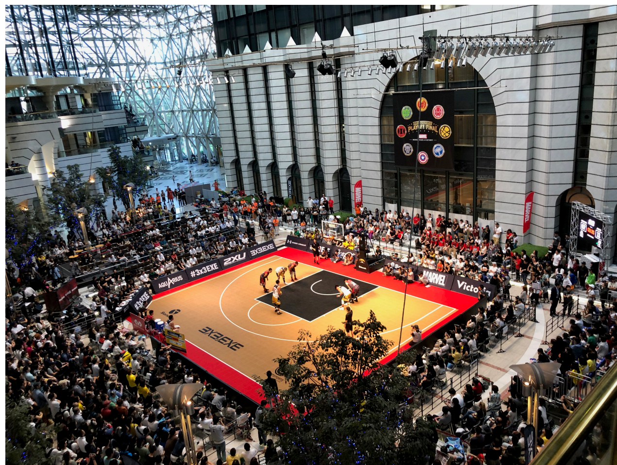
Omori Bell Port, Tokyo, Japan

It is a much faster and more exciting game and accessible to fans (usually free to watch, closer to the court), and with a portable half court, the game can be played almost anywhere - in the middle of a shopping mall, next to a shrine, or in front of a huge Gundam statue. The passionate fanbase in Japan has made 3x3 in Japan the perfect match for an exciting experience for both players and fans.